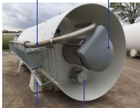
Ladder with safety cage