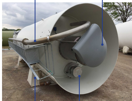
Ladder with safety cage